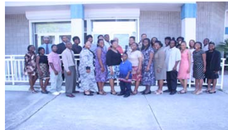
Youth and families attend the recent GAPP graduation

the program also provides in home anger management and family counseling by a licensed Social Worker. The Sanderlin Center is very pleased to partner in this important effort.