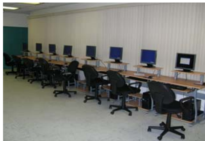
One Half of the Computer Lab at AALC